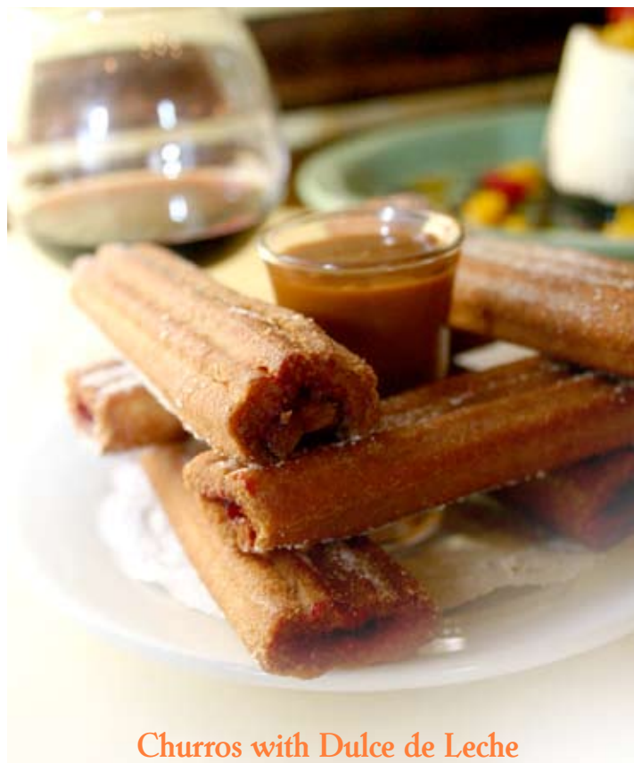
Churros with Dulce de Leche

Banana Chimichanga A unique deep fried treat with fresh banana and rich chocolate. Served warm with whipped cream . . . . . 5.25