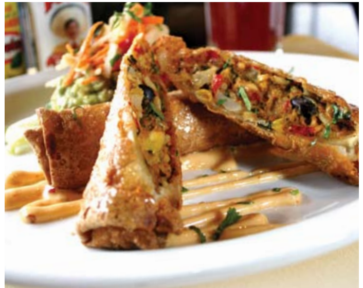
Arizona Egg Rolls

Mesquite Chicken & Corn Chowder . . . . . 5.25